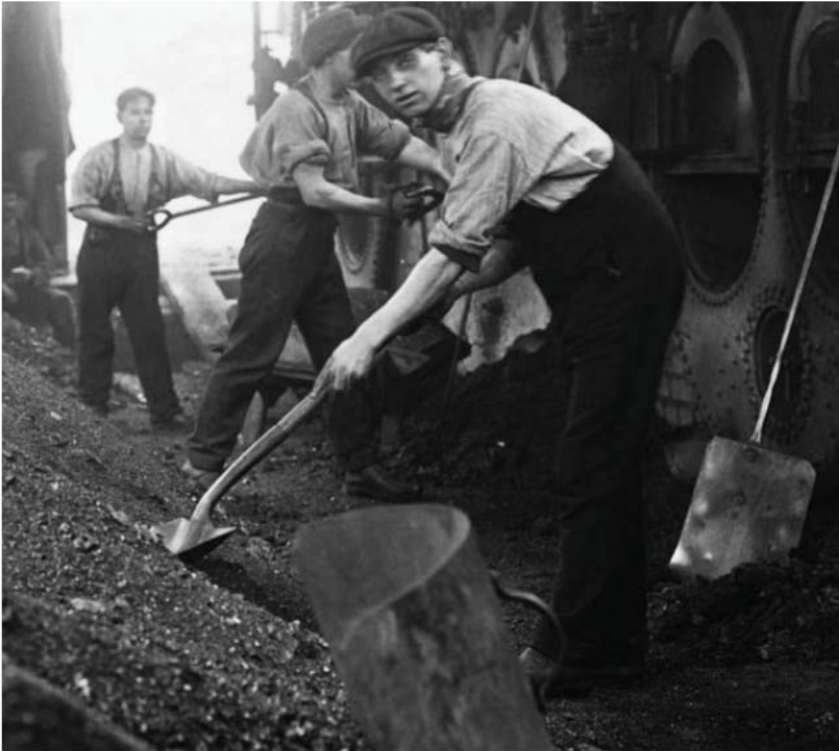
Workers shovel coal in England, 1912

Everything changed during the Industrial Revolution, which began around 1750. People found a new source of energy. That source was fossil fuels — coal, oil, and natural gas. Fossil fuels formed underground from the remains of plants and animals from long ago. Burning fossil fuels released energy that came from the Sun. The energy had been stored for hundreds of millions of years.