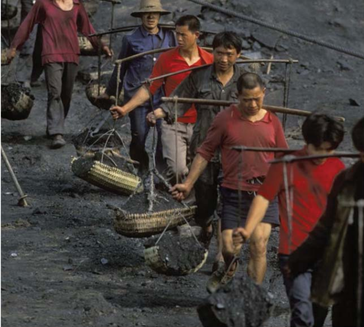
Workers haul coal to waiting barges near Fengjie, China, 2005

However, the benefits of industrialization have come at great cost. For one thing, the rate of change (acceleration) is now incredibly rapid. It's so fast that individuals and social systems struggle to keep up. And perhaps life has less individuality now that most things are made in factories.