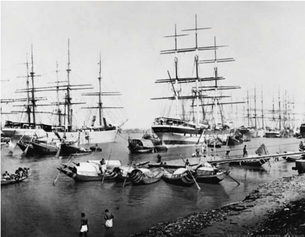
British sailing ships in Calcutta Harbor, c. 1860