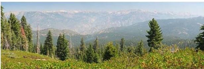
Sierra Nevada Range