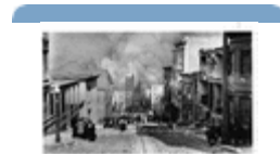
Crowds watching the fires set off by the earthquake in San Francisco in 1906

straining against one another suddenly fracture and "slip." Earthquakes occur most often along geologic faults , narrow zones where rock masses move in relation to one another. The major fault lines of the world are located at the fringes of the huge tectonic plates that make up the Earth's crust.